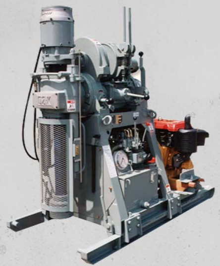
Spindle Type (D Series)

Small lightweight machine. Easy to disassemble, transport, and reassemble. Could be applied to any types of drilling engineering such as survey, injection work, and small-sized water well drilling, even in limited workspace.