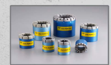
Impregnated Diamond Core Bits

Compact and lowered drilling rig, very agile, designed for work in very confined spaces and inside buildings. Ideal for Foundations, Micropiles, Geotechnics and Surveys in very limited spaces.