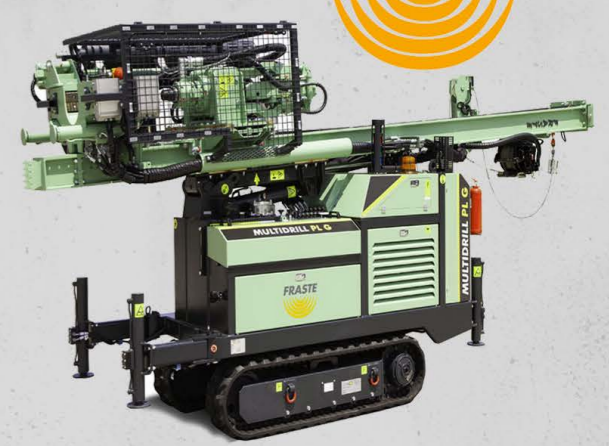
MULTIDRILL PL G

Compact and lowered drilling rig, very agile, designed for work in very confined spaces and inside buildings. Ideal for Foundations, Micropiles, Geotechnics and Surveys in very limited spaces.